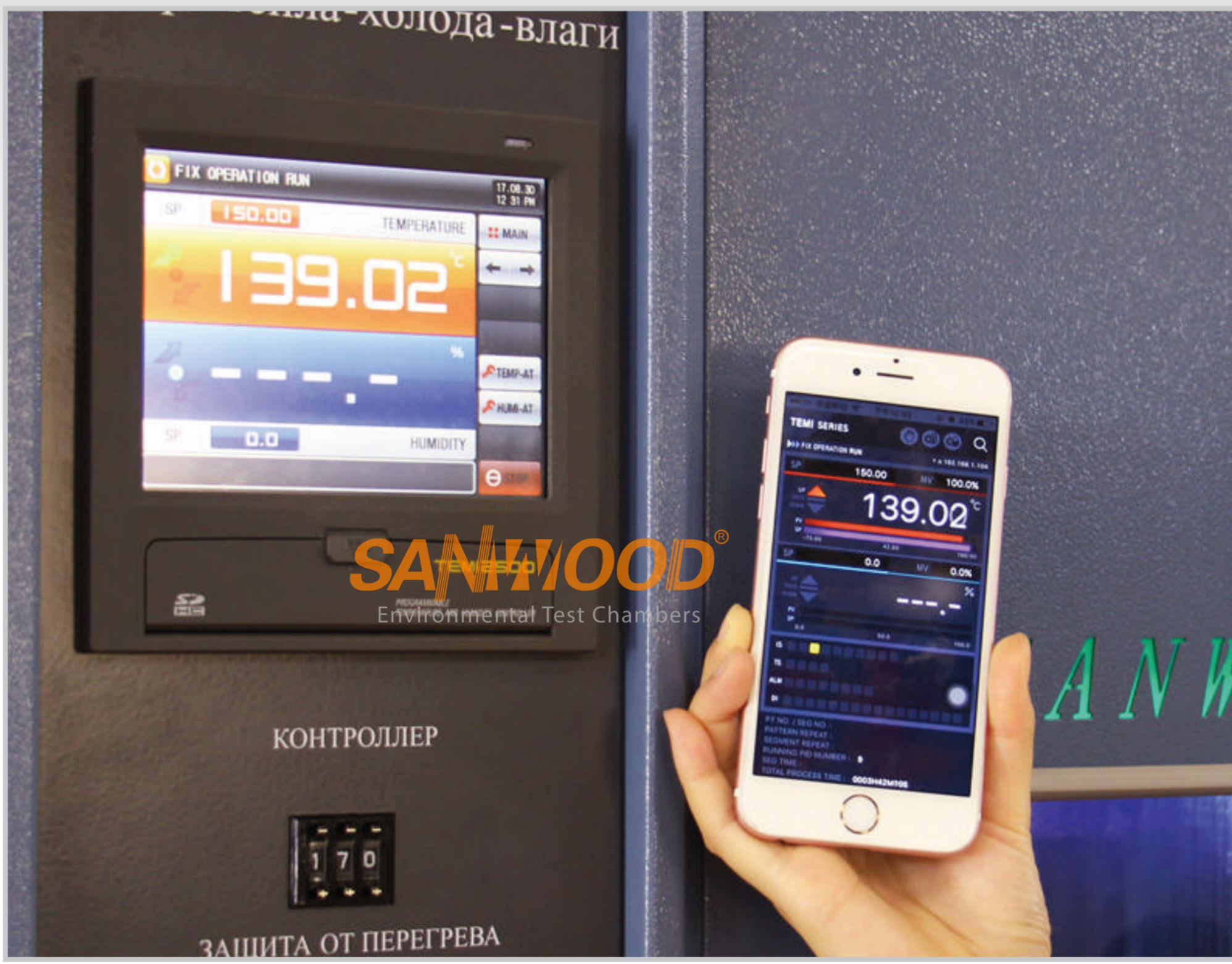
Remote network system